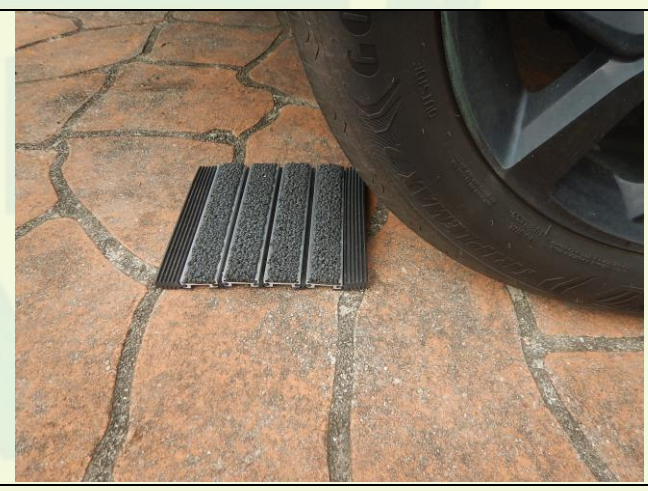
Rolling Load (After Test)